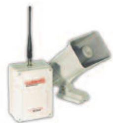
LoudMouth Wireless PA