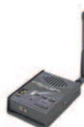
Ritron Base Station