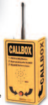
Callbox with "Light Duty" Enclosure